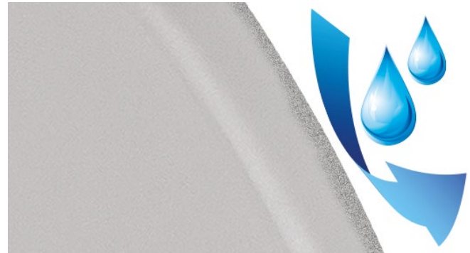
PLASTIC WITH EASY-CLEAN TREATMENT