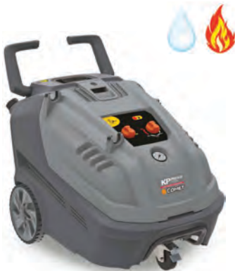
KP Classic 5.12 12/180 T

Three Phase electrical hot and cold high-pressure cleaner with operating pressure up to 200 bar. Fuel tank with level floater and fill up filter. Regulated high-pressure detergent suction. "No fuel" indicator.