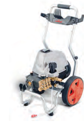
CI C25K EM

The CI C25K EM trolley cold pressure washer stands out for being compact and robust. Equipped with a trolley that has a robust, resistant structure thanks to its large back wheels with rubber treads and a practical aluminum handle, the CI C20 EM is solid but also agile and easy to move.