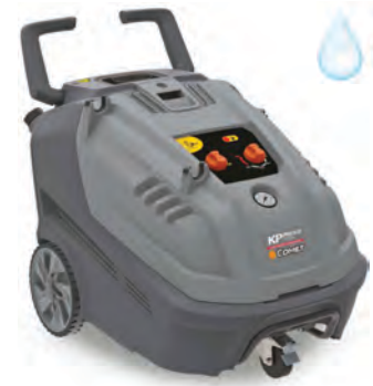
KP Classic 3.10 10/140 M

Three phase electrical cold water high-pressure cleaner with operating pressure up to 230 bar. Big wheels which enables better handling over uneven ground. Extractable 3.5 L detergent tank.