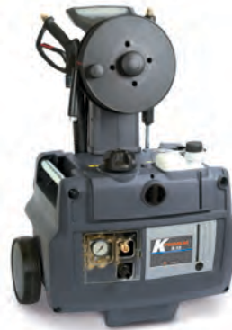
K Premium 9.15

Single phase /Three phase electrical cold water high-pressure cleaner with operating pressure up to 160/210 bar. Sturdy injection moulded plastic casing. Practical to use in both vertical and horizontal operating position. Detergent tank of 3.5 L.