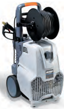
K 250 11 210T/160M

Single phase /Three phase electrical cold water high-pressure cleaner with operating pressure up to 160/210 bar. Sturdy injection moulded plastic casing. Practical to use in both vertical and horizontal operating position. Detergent tank of 3.5 L.