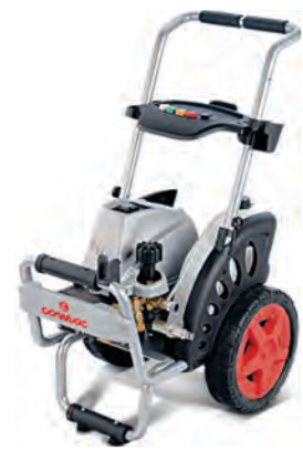
CI C30 EM

The CI C30 EM is a trolley cold pressure washer designed to be compact yet robust. it is a professional powerwasher capable of offering the perfect combination of performance, user-friendliness and easy maintenance. The CI C30 EM's robust metal trolley and two large wheels with rubber treads make it a solid high-pressure washer that is still easy to move.